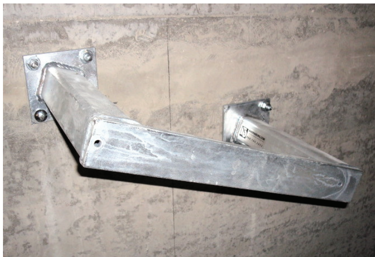
CDWR01-G mounted to cast concrete wall